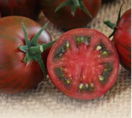
Purple Zebra. If you want a tomato that looks just as good as it tastes, search no more. According to AAS, Purple Zebra is a national winner with fruit that is "firm in texture, complex in flavor and has a taste more sweet than acidic." This variety has high resistance to tomato mosaic virus, verticillium wilt, fusarium wilt and late blight. Start seeds indoors 4-6 weeks before the last frost for best results. In the garden, space transplants no less than two feet apart or, if using containers, select 5-gallon pots with drainage. This variety produces 150-200 green-striped, purple tomatoes and requires staking. Most gardeners can begin harvesting tomatoes 80-85 days after transplant.