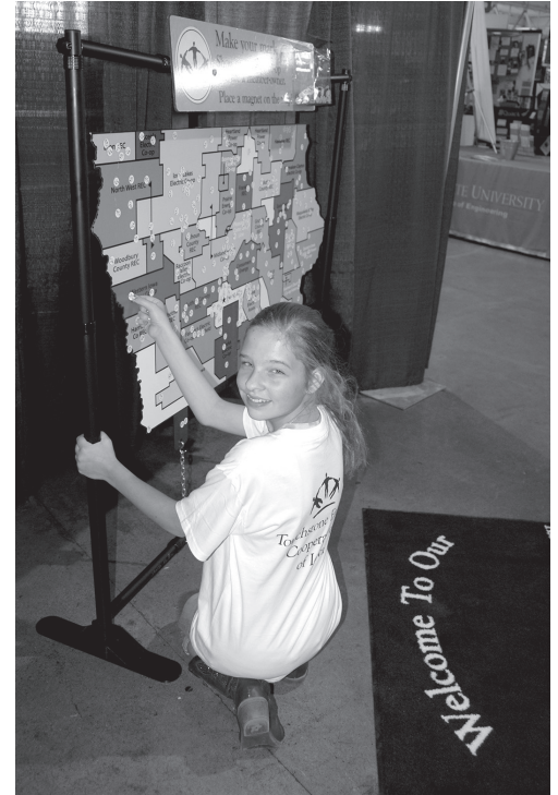
A 4-H participant at the 2016 Iowa State Fair marks her co-op on the magnetic map inside the Touchstone Energy of Cooperatives of Iowa display in the 4-H Exhibits Building. Visit the display this year and register to win a Nest Learning Thermostat.

Be sure to visit the Touchstone Energy display when you're at the Iowa State Fair and go to touchstoneenergy.com for more information on how to save energy and the value of cooperative membership. 15.03.01